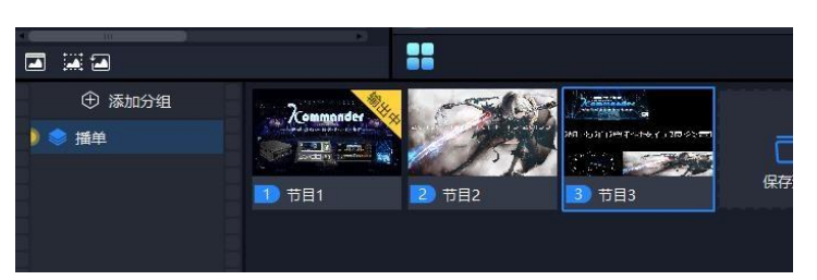
Figure: The "playlist" option appears in the app program list. You can switch between the playlist and the single program in this interface.

At the same time, the playlist can also be added to the schedule.